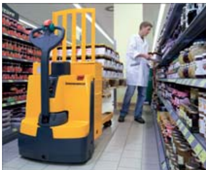
Back friendly lift height with optional load backrest