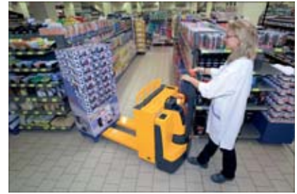
In operation in a store

the edge of a loading dock or dock-leveler, unlike a spring loaded wheel they easily drive back into safety.